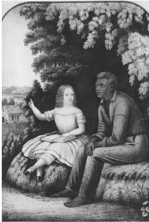
“Little Eva and Uncle Tom,” AAS lithograph.

Reconstructing the reading histories of Uncle Tom’s Cabin and My Life poses different methodological problems that will be considered with special emphasis on links that have developed between history and literary criticism, links that have been indispensable to recent reading studies. Interdisciplinary methods will