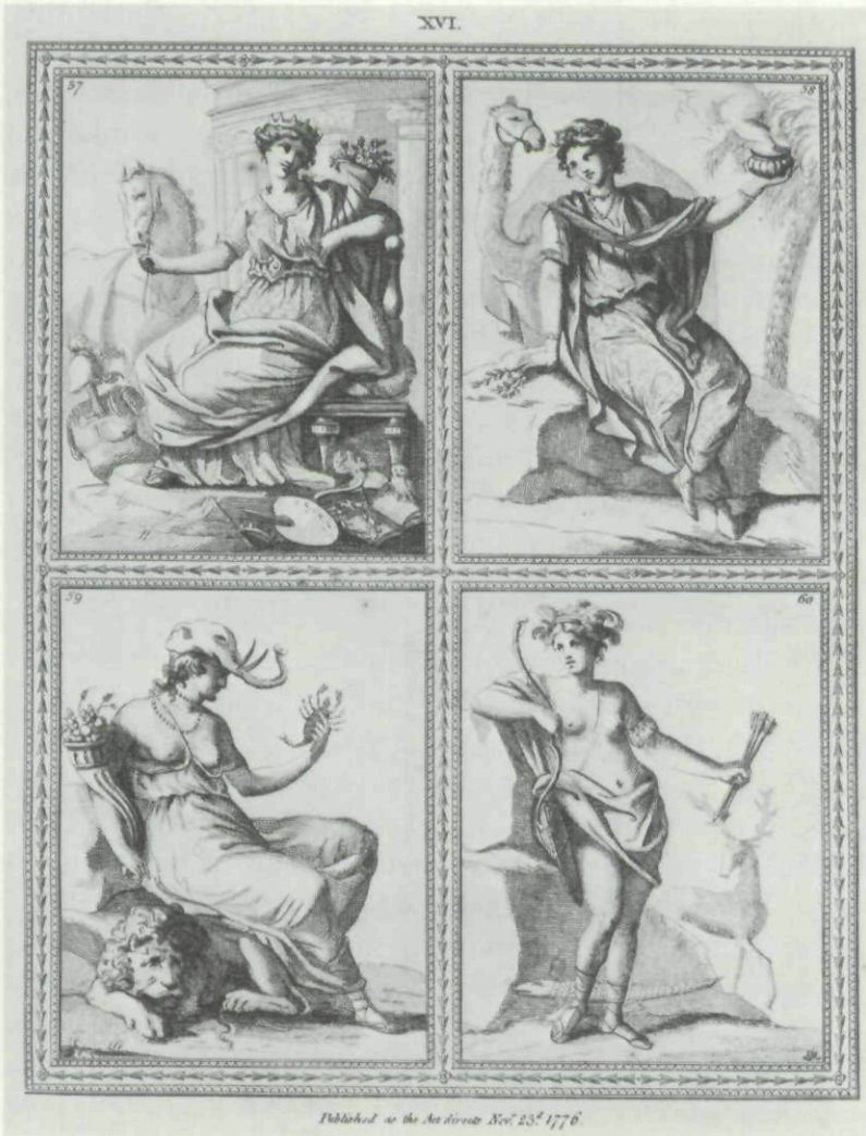
Fig. 3. George Richardson, ed., Iconology , 2 vols. (London, 1779), vol. 1, plate 16.

drawings about public affairs had been sold since the Reformation, only in the mid-eighteenth century did supply and demand explode as economical techniques for producing sophisticated prints