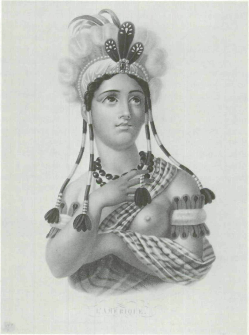
Fig. 7. 'L 'Amerique,' by Jules Antoine Vauthier, engraved by Noel Francois Bertrand (181?).