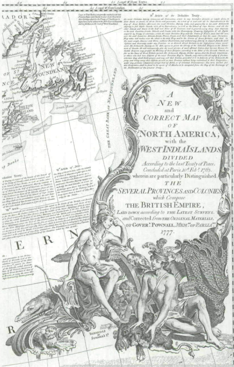
Fig. 6. Cartouche of Emanuel Bowen map, 'A New and Correct Map of North America, with the West India Islands. Divided According to the Last Treaty of Peace, Concluded at Paris, 10th Feby 1763' (1777). American Antiquarian Society.