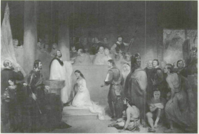
Fig. 18. John G. Chapman, 'Baptism of Pocahontas at Jamestown, Virginia, 1613' (1840). United States Capitol Art Collection. Reproduced by permission of the Architect of the Capitol.

nation was supplementary and mythic rather than primary and explicit. The Indian princess could not herself represent the nation. Too much enmity and oppression stood in the way. She could, however, play a supporting part that denied the enmity and seemed to overcome the division between whites and Indians. Though never explicitly spelled out, her mythic role became quasi-official in certain national emblems. In 1854, the U. S. Treasury issued a three-dollar gold piece on which the profile of Liberty was embellished with an Indian headdress. Since the Indian princess had always been endowed with Caucasian features, the two images merged. The gold dollar and then the American penny followed suit. Pocahontas herself adorned one of the handsome national bank notes, printed from the 1860s to the 1890s, which reproduced the historical murals that decorate the rotunda of the U. S. Capitol (fig. 18). On the twenty-dollar note, a dark-skinned