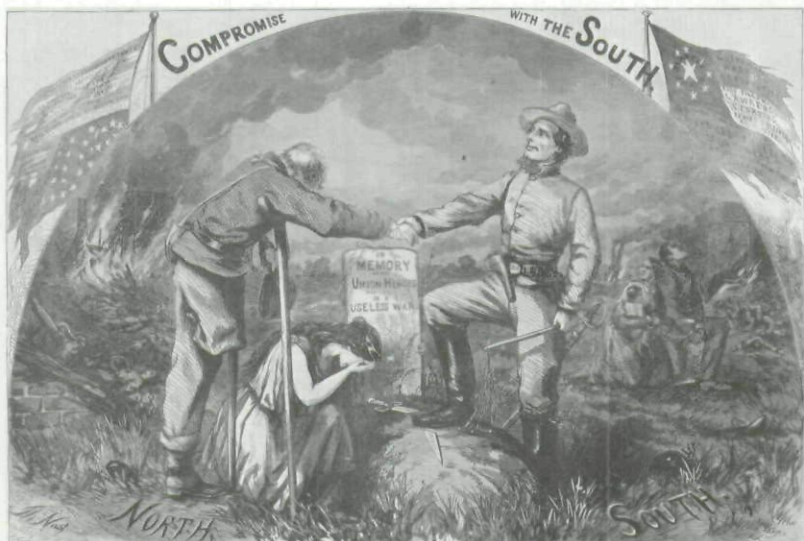
Fig. 15. Thomas Nast, 'Compromise with the South,' Harper's Weekly, September 3, 1864, p. 572. American Antiquarian Society.

When Lincoln died, Nast's Columbia grieved again, this time at his casket. In other moods, she cast a ballot, haunted the nightmares of traitors, taught school, protected persecuted minorities from infuriated mobs, and moved like a queen at international gatherings. Her most desperate moment (fig. 16) came in 1871, lying prostrate under the paws of the Tammany Tiger in a Roman arena, her diadem broken, blood trickling from her head, while imperial political bosses look down smugly from seats of honor in the stands. The New York Times called the cartoon 'the most impressive political picture ever produced in this country.' 31