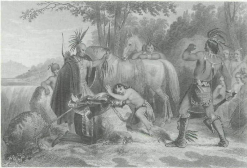
Fig. 17. Pocahontas saving the life of Capt. John Smith. From the graphic arts collections in the American Antiquarian Society.

As Capt. John Smith told the story, the nubile maiden saved his life by throwing herself protectively upon him at the moment of his intended execution (fig. 17). Pocahontas then embraced Christianity, married another English settler, and was carried off to an early death in England. Many version of her sacrificial ardor circulated in nineteenth-century stories, histories, ballads, plays, and pictures. By yielding herself completely to the European newcomers, Pocahontas had symbolically conferred her pedigree upon them. In a more intimate sense than any peace treaty could accomplish, she had given them an indigenous heritage. She was, in effect, the primal American woman, uniting the land and its conquerors through the mediation of her body and spirit. 37