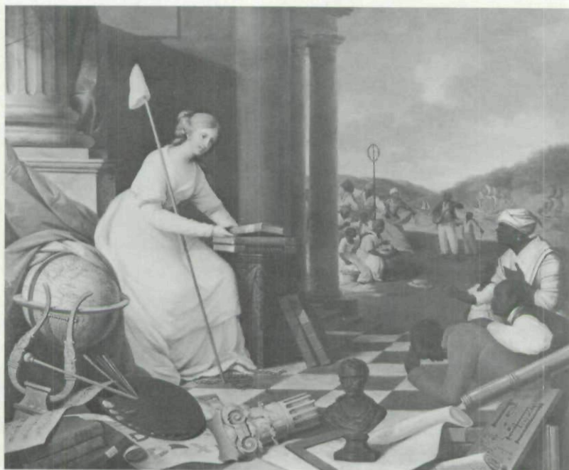
Fig. 11. Samuel Jennings, 'Liberty Displaying the Arts and Sciences' (1792). Reproduced by permission of the Library Company of Philadelphia.

hopes for the new nation, it nowhere identifies the central figure as uniquely American. She can be viewed as either national or universal, or both. 22 The picture documents the rise of an antislavery movement and proudly identifies it with the American republic.