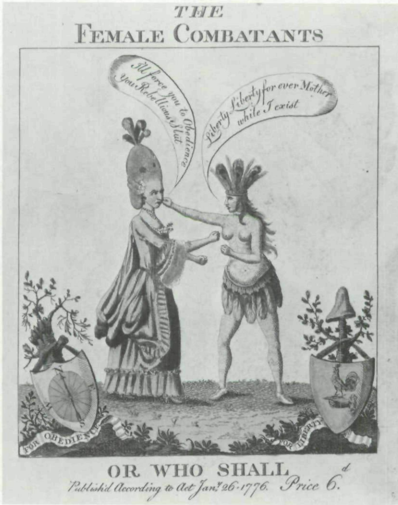
Fig. 4. 'The Female Combatants' (1776). Courtesy of the Print Collection, Lewis Walpole Library, Yale University.

(fig. 4). More commonly, both of them were harassed by wicked politicians. An especially powerful, widely printed cartoon, occasioned by British enforcement in 1774 of the new tax imposed on tea, displayed a disheveled Britannia weeping in helpless shame