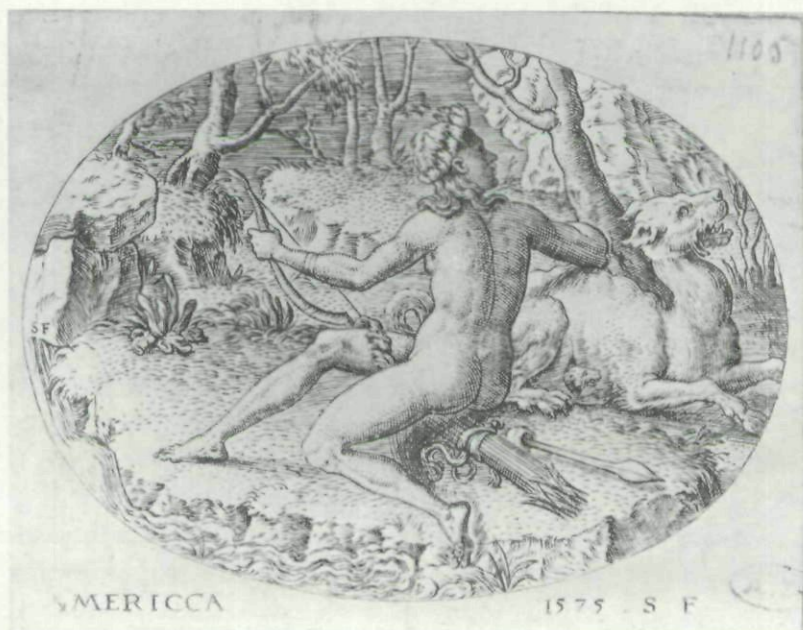
Fig. 1. 'America,' by Etienne Delaulne (1575), from four engravings, 'Europe,' 'Asia,' 'Africa,' 'America,' James Hazen Hyde Collections, New-York Historical Society.

instruments at her feet, to 'denote her superiority above all other parts of the world, with respect to arms, to literature, and all the liberal arts.' Her crown should 'show that Europe has always been esteemed the queen of the world.' America, on the other hand, would require only her bow and arrows, a few feathers, and a wild animal somewhere about (fig. 1). As a personified abstraction, America sprang from a Eurocentric world vision. 3