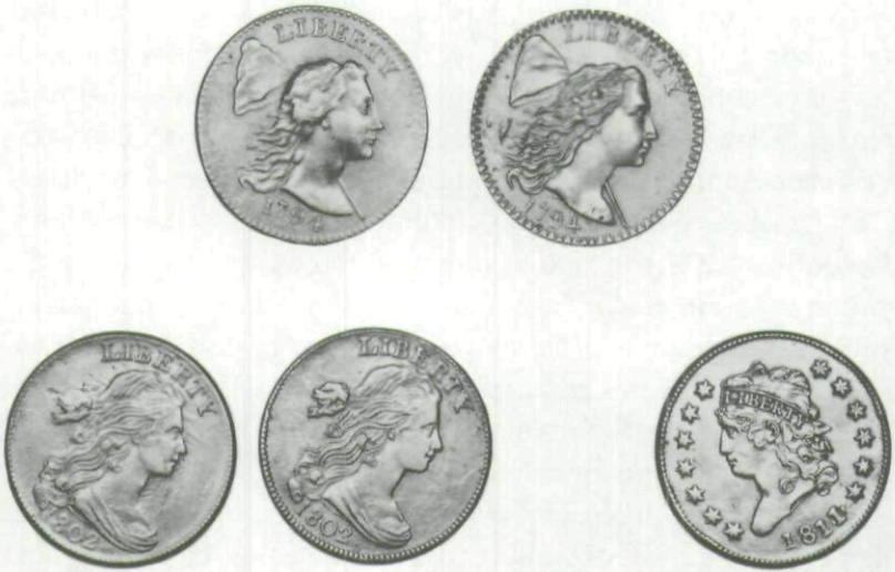
Fig. 10. Coins produced by the U.S. Mint.

multivocal nature of the symbol. The first name seemed to identify a full-scale replacement for Britannia; it proclaimed the pride of an upstart rival in her own national strength and achievements. The second name also alluded to universal needs and aspirations. It merged a specific national identity with a transnational symbol of human rights. The resulting ambiguity fostered Americans' self-centered delusions concerning the unbounded appeal and relevance of their own institutions. Nevertheless, in the young republic the mingling of national consciousness with universalism significantly extended the reach of humane concern for people who were excluded or uncared for.