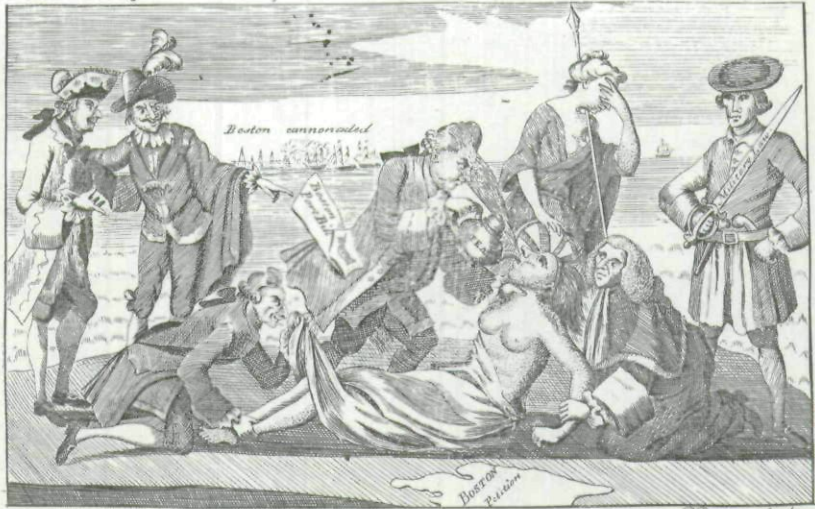
The able Doctor, or America Swallowing the Bitter Draught

Fig. 5. 'The Able Doctor' (1774), engraving for the Royal American Magazine, volume 1, number 10, by Paul Revere.