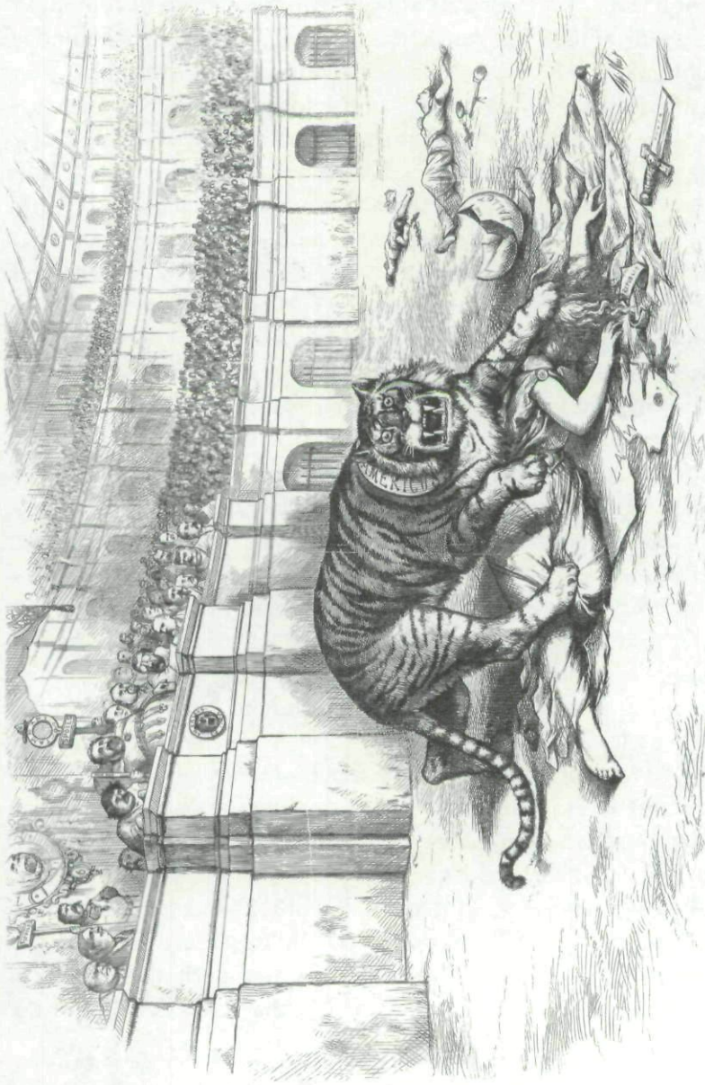
THE TAMMANY TIGER LOOSE.—"What are you going to do about it?"