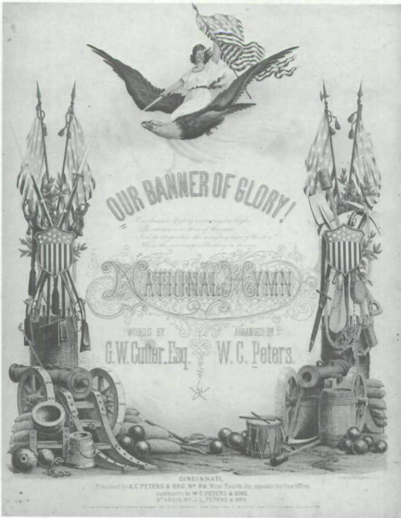
Fig. 13. Sheet music cover for 'Our Banner of Glory,' by G. W. Cutter (1861).