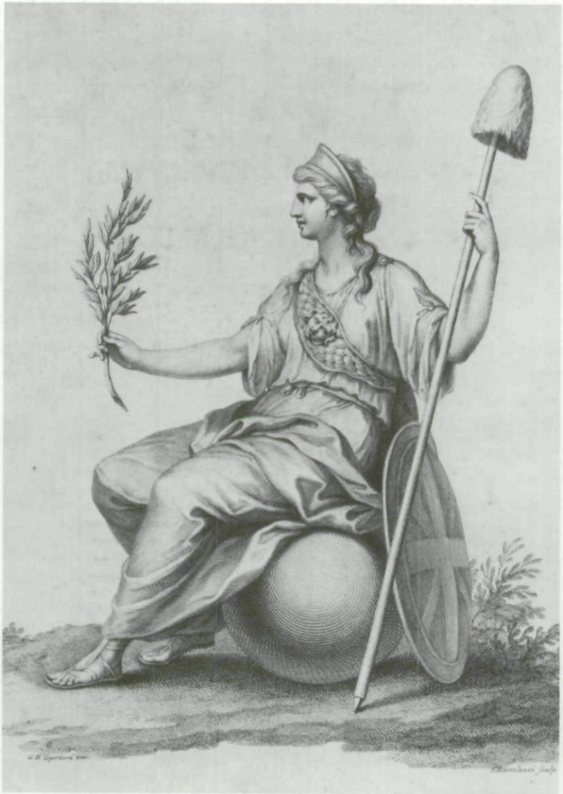
Fig. 8. 'Britannia,' G. B. Cipriani, engraved by F. Bartolozzi.