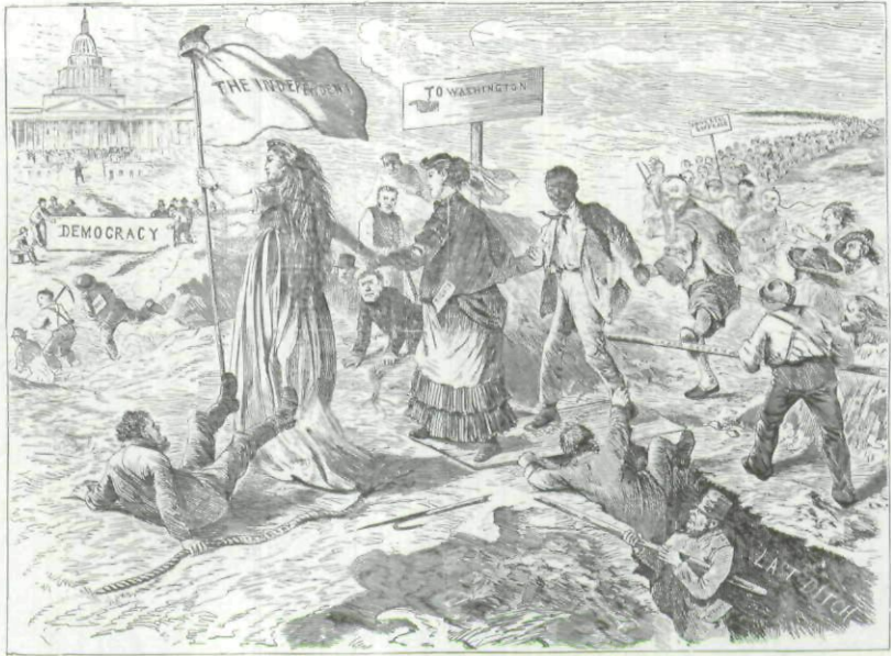
Fig. 14. March of 'Universal Suffrage,' The Independent (New York), January 6, 1870.

into people's lives. Especially, the war assigned new responsibilities to women. Just so, Columbia or Liberty took on a most unladylike vigor in political cartoons. In some, she still did nothing but beseech the president for action. In other drawings, however, she became a scourge of the wicked, an avenging angel of righteousness (fig. 13). Instead of carrying her cap on a staff, Liberty now donned the cap and employed her right hand to brandish a sword. 28