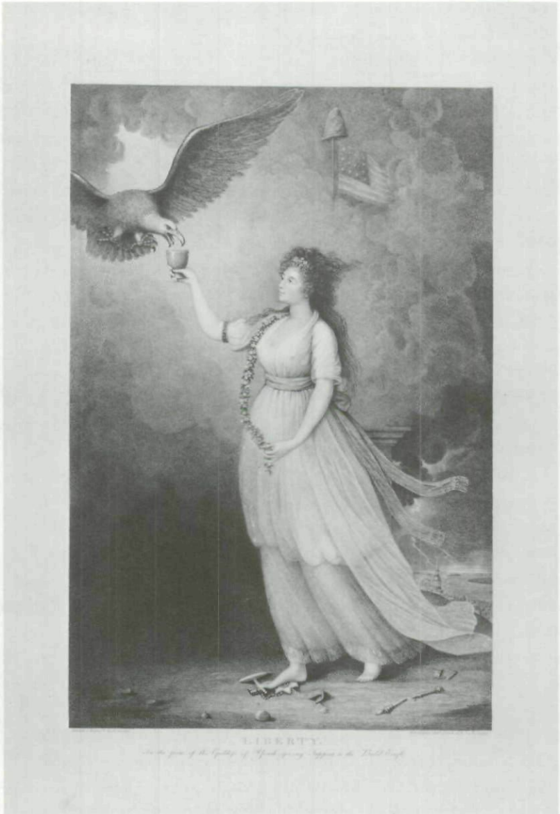
Fig. 12. Edward Savage, 'Liberty as Goddess of Youth Feeding the American Eagle' (1796). Reproduced by permission of the Worcester Art Museum, Worcester, Massachusetts.