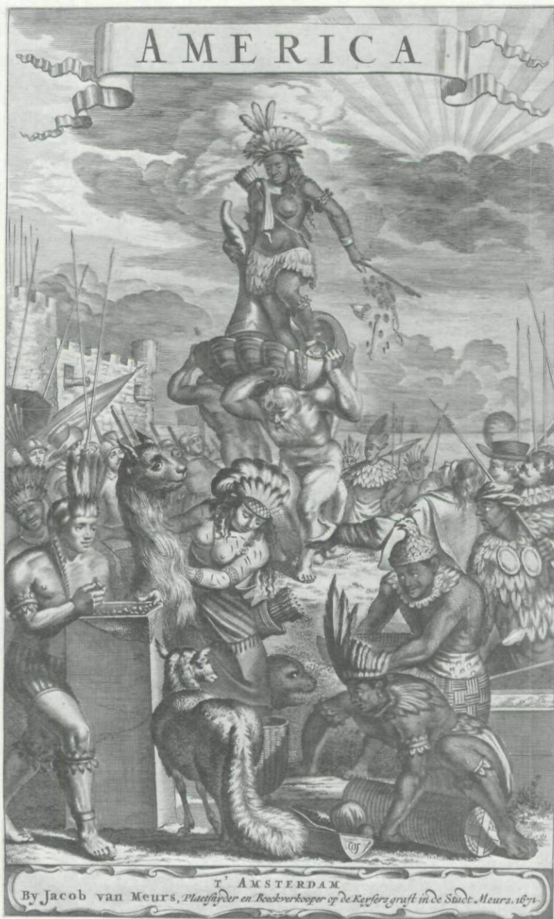
Fig. 2. Frontispiece to Jacob von Meur's Die Unbekante Neue Welt oder Beschreibung des Welt-teils Amerika und des Sud-Landes (Amsterdam, 1683). American Antiquarian Society.