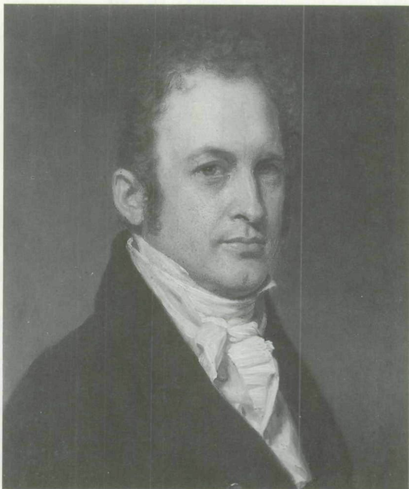
Fig. 1. Ethan Allen Greenwood, Self portrait, probably Boston, Mass., ca. 1820. Panel, 8 x 6 inches. Courtesy, Worcester Art Museum, 1946.37, Bequest of Marianne Russell Bartholomew.