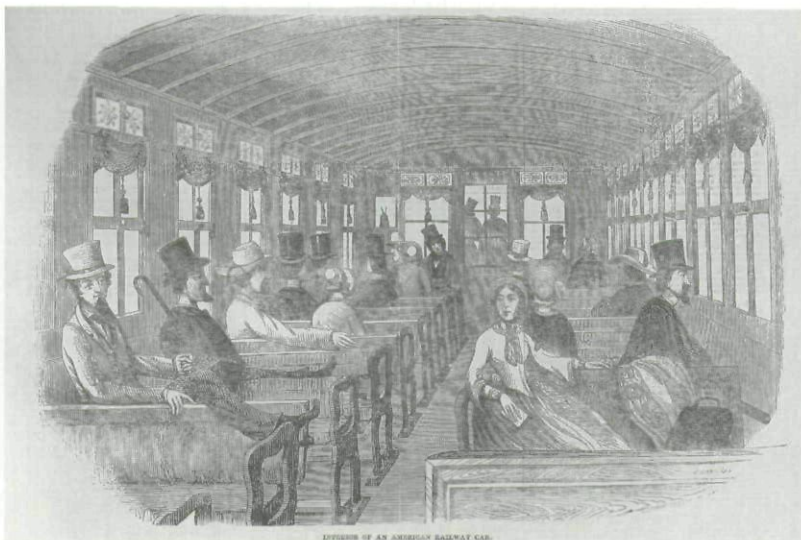
Fig. 3. 'Interior of an American Railway Car,' Illustrated London News 20 (April 10, 1852): 285.