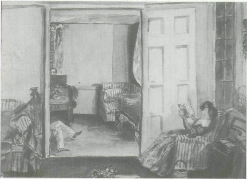
Fig. 2. Katherine Jane Ellice, 'The Drawing Room at the Seignury House, Beauharnois, Lower Canada' (1838). Watercolor over pencil.

watercolors of Katherine Jane Ellice recall the act of reading during steamboat trips between Montreal and Quebec City, as well as the pleasures of summer reading and music at the Beauharnois manor, near Montreal (fig. 2). The leaning position of some books in a circa 1790 portrait by William Berczy suggests a regular and perhaps intensive use of the family library, and his 1809 portrait of the Woolsey family shows the reading of both a boy and his father, whose newspaper is lying on a table.