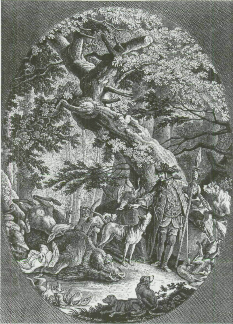
Fig. 6. 587 (reduced).