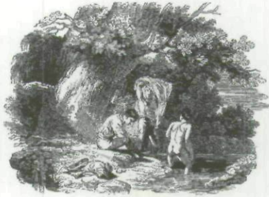
328, no. 2.