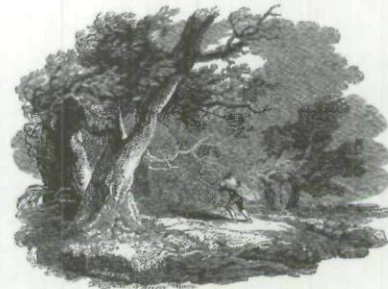
328, no. 4.

The engravings are of high quality and reveal Anderson's great strength in the use of light and shade. In no. 1, the detailed vegetation catches light as it comes through the heavy canopy of the large tree above; there is a sense of isolation and peace, of relaxation in the man's pose and in the heavy shadows in the right background. Anderson's reengraving of the same scene, but reversed and enlarged, appeared in 1822 in Christopher Sturm, Reflections of the Works of God in Nature , 734, no. 1, where it is well printed. This larger version was also used in the 1829 Cabinet of Instruction, Literature and