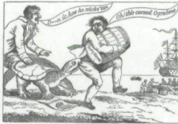
2325, no. 1. Graphic Arts Collection, National Museum of American History, Smithsonian Institution.