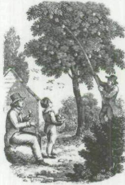
1086, no. 5.