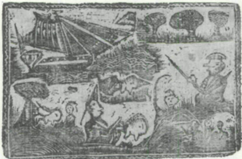
Detail: Providence preserving the troops at Charlestown.