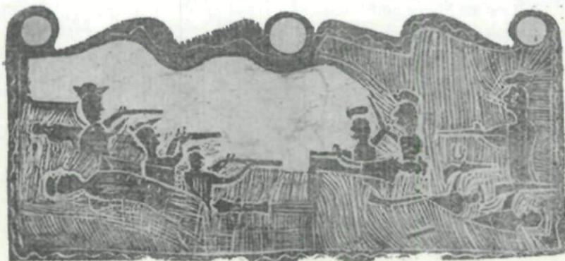
Detail: The Bunker Hill engagement.