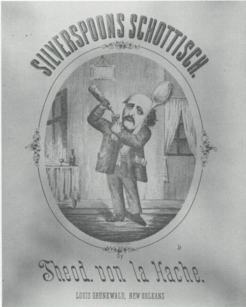
Fig. 2. Theod. von la Hache, Silverspoons Schottisch [Litho. H. Wehrmann N.O.], New Orleans: Louis Grunewald. American Antiquarian Society.