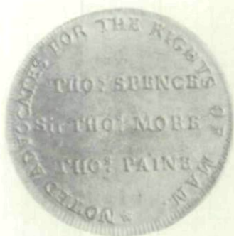
TOKEN HALF-PENNY. REVERSE NO. 320 ENLARGED