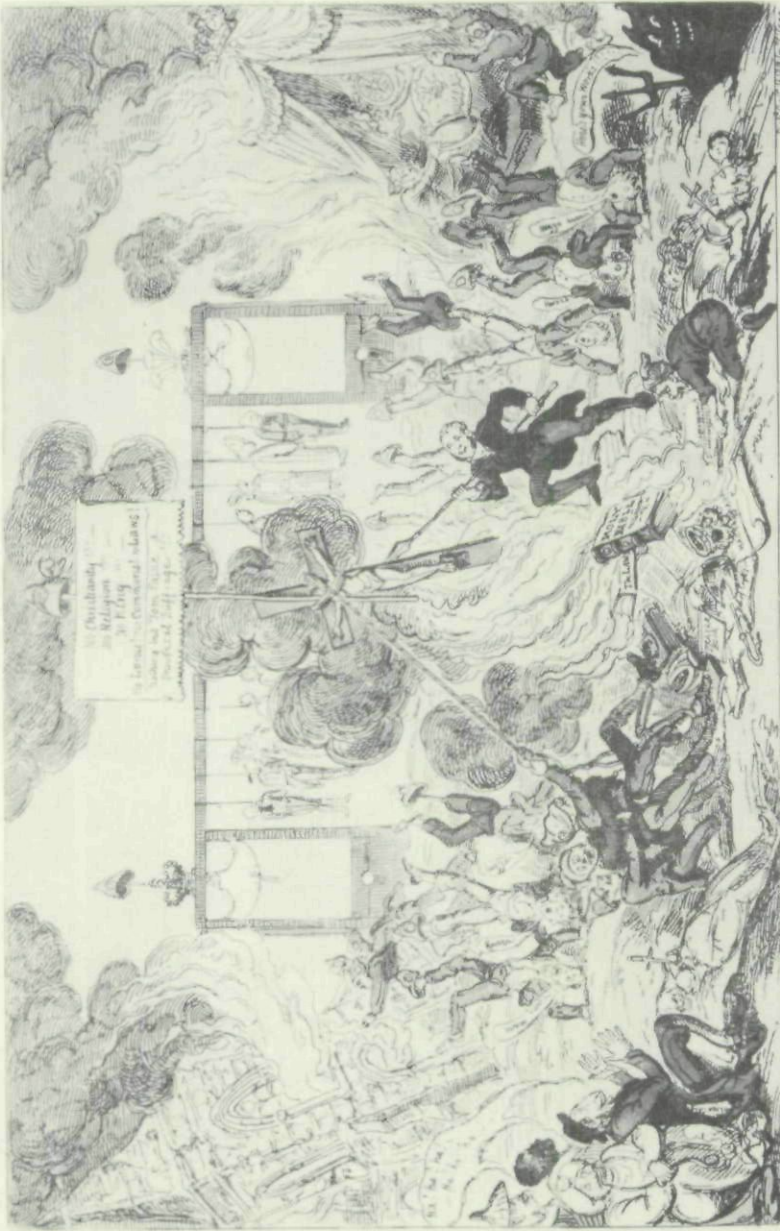
The ACE of REASON in the World burned Solesby complete in Tom Peares WORKS!! Dedicated to the Archbishop of CARLILE