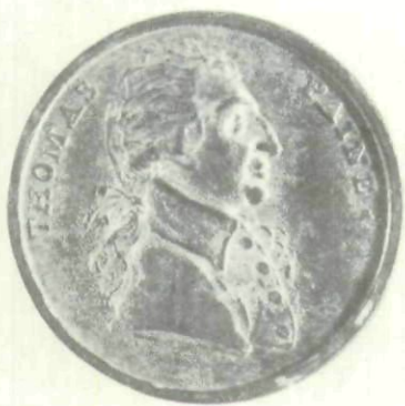
TOKEN PENNY. OBERSE NO. 300 ENLARGED